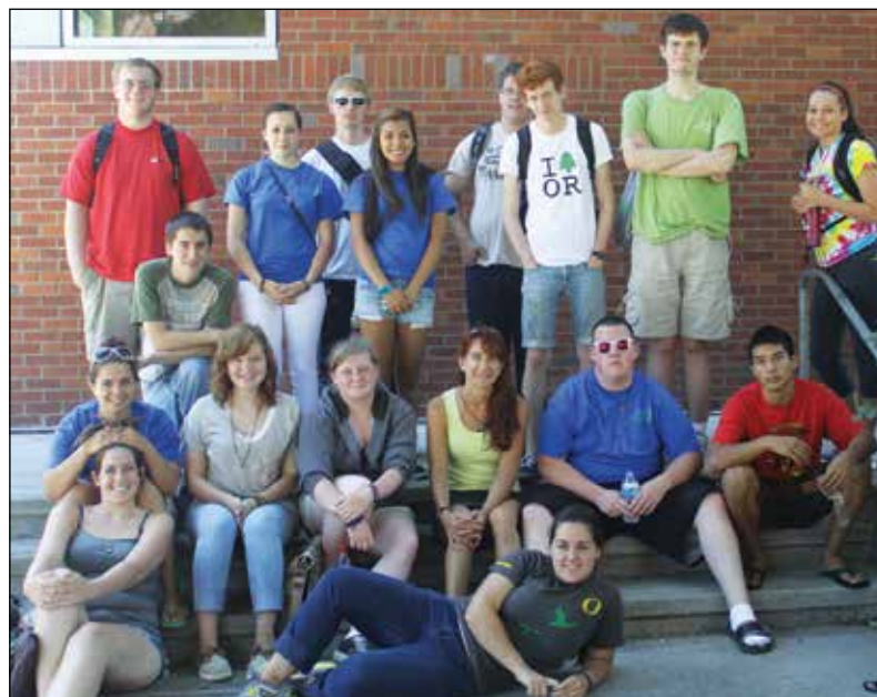
SAIL Senior Journalism Camp, Summer 2012

Since the summer of 2005, SAIL has grown from fifteen high school students to 150, one camp to eight, and from ten faculty volunteers to more than 100. Currently, SAIL is seeking sophomore-through-senior-level UO students to act as college prep mentors for our SAIL participants. This is a fantastic way for UO undergraduates to build interpersonal and organizational skills, and the experience is something that can really shine on a résumé. SAIL camps offered include performing arts, psychology, biology, physics, physiology, journalism, international studies, economics and forensics. We pride ourselves in the amount of faculty members who volunteer their time and feel a sense of pride in doing so.