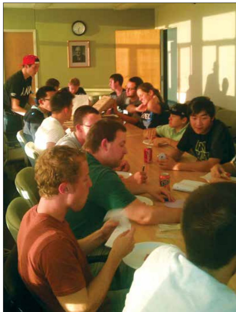
Interest in the newly formed Economics Club is growing.